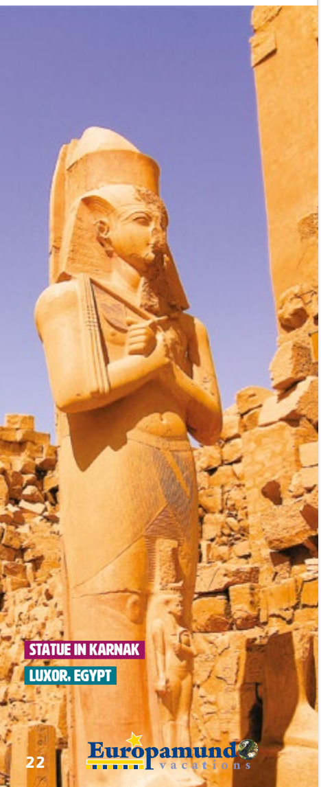
STATUE IN KARNAK LUXOR, EGYPT

Breakfast. Early departure to border of Israel and Jordan. Arrival at Sheik Hussein Bridge to complete border and visa procedures. Welcome to Jordan! We explore the FORTRESS OF AJLUN , an imposing castle dating back to the 12th century. In this area, Muslims and Orthodox Christians have always lived together. We visit the historic CHURCH OF SAINT SERGIUS . Shall we all pray for peace? Lunch included. We continue to JERASH to visit its impressive Roman archaeological site. We then travel to AMMAN . Arrival and accommodation. NOTE: The Sheik Hussein border must be crossed on a special bus for this purpose. This costs around $3 per person, which must be paid directly by the passengers themselves. FEES: Each country requires an entry/exit fee that passengers must pay directly at their destination. For guidance purposes, these are the fees/visa fees that may apply (prices subject to change without notice): Israel: $32 (Departure Fee to Jordan); Jordan: 40 dinars/$60 (Sheik Hussein Border visa).