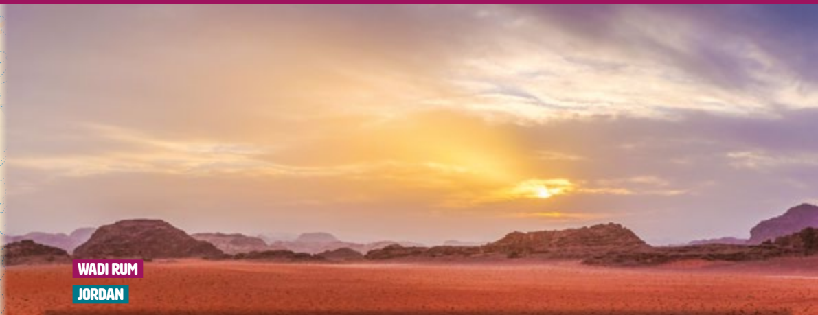
WADI RUM JORDAN