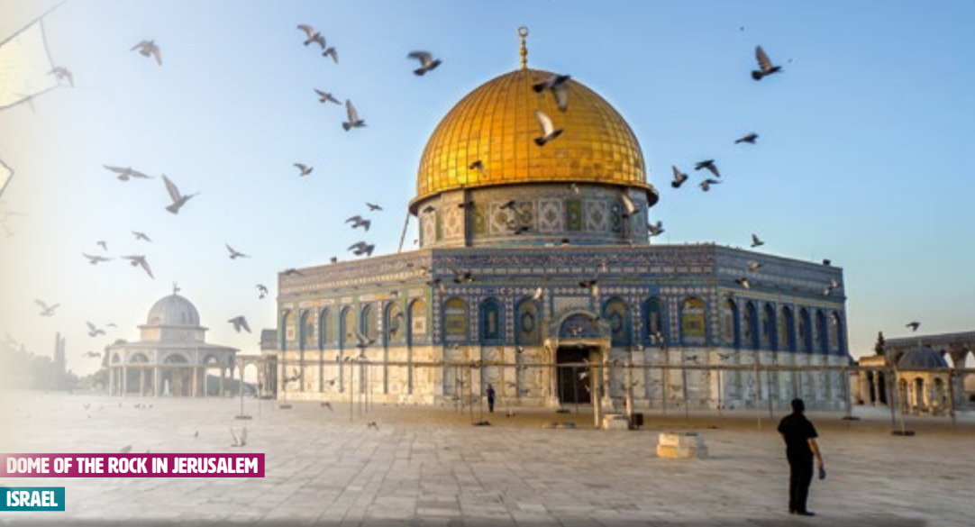
DOME OF THE ROCK IN JERUSALEM