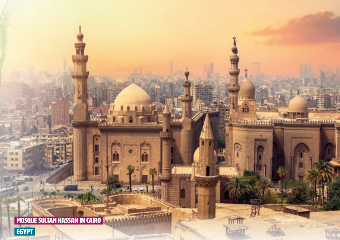
MOSQUE SULTAN HASSAN IN CAIRO